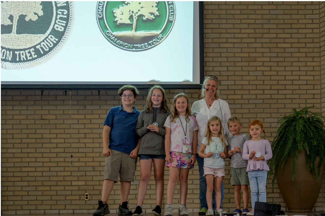
above: Our first Champions! Six kids completed the Champion Tree Tour Scavenger Hunt and were awarded patches and pins at our first Pinning Ceremony on Tuesday. Congrats to the young naturalists!