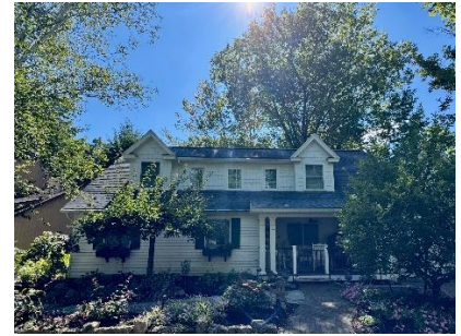
The Maestro Cottage 39 South Ave Circa 1981