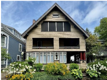
The Selden Cottage 28 Peck Circa 1863