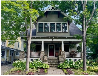
The Acker Cottage 44 Cookman Circa 1902