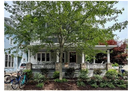
Branch Cottage 32 Peck Circa 1910