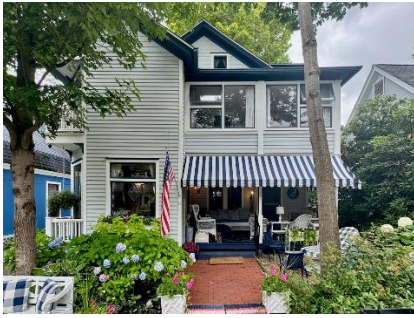
Carter Cottage 43 Cookman Circa 1894