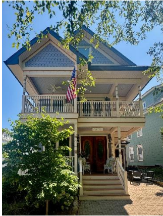
Lilla Hus 13 Center Circa 2011