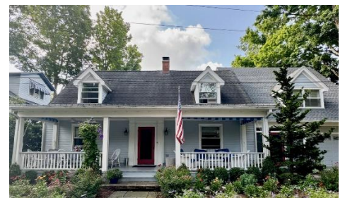
The Scavone Cottage 45 Cookman Circa 1937