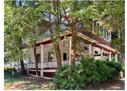
The Whitla House 10 Peck Circa 1899