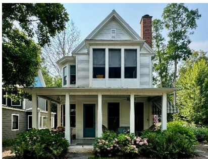
The Teat Cottage 51 Peck Circa 2019