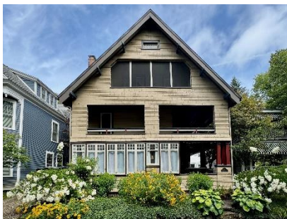
The Selden Cottage 28 Peck Circa 1893