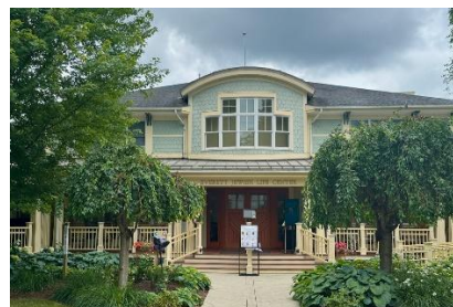
Everett Jewish Life Center 36 Massey Circa 2009