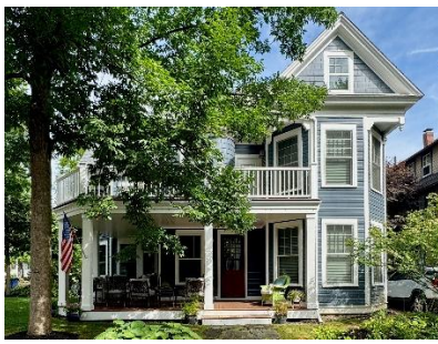
Sanger Lake House 30 Peck Circa 1888